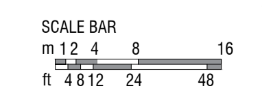
1 OVERALL SITE PLAN DPI.0 SCALE: 1:500